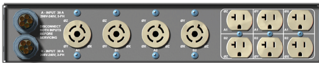
(4) L21-20R and (6) 5-15R output receptacles