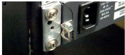
Figure 2 – Installation of Tie Wrap Retainer