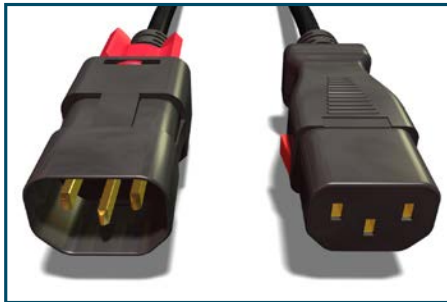
zLock C14 - C13

The zLock™ family of locking power cords eliminates accidental and vibration disconnects. zLock™ does not require a special mating plug or receptacle in order to have a secure connection. Simply replace your existing power cord with zLock™ and enjoy your increased uptime and peace of mind.